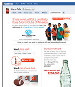
Coke's Facebook program is the first of its kind.

NEW YORK (AdAge.com) -- Pepsi is putting its Super Bowl ad dollars to work by helping communities and bypassing TV spots in the game. Coca-Cola is doing the same -- but using its Super Bowl advertising as a hook.