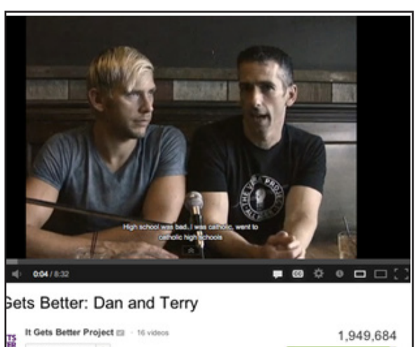
(Screenshot of Savage and Miller's video taken from http://

What started as one video followed by Savage's call to action for other LGBTQ adults' participation soon morphed into an online repository of more than 50,000 videos from LGBTQ-identified and straight allies; the establishment of an official IGBPbranded website (http://www.itgetsbetter. org); a strong cross-platform social media