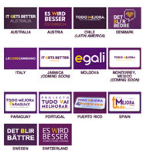
(Screenshot of the IGBP International affiliates taken from http://www.itgetsbetter.org/content/international-affiliates/)

Using the IGBP as the site of exploration and guided by sociologist Patricia Hill Collins' matrix of domination framework that considers how structural, disciplinary, hegemonic, and interpersonal oppressions are interwoven, I set out to answer two research questions. First, I sought to understand differences between user-generated media and traditional media (including advertising) representations of LGBTQ individuals and asked: How are race, class, gender, and sexual orientation discussed in the IGBP? Next, I sought to understand motivations for participation in a crowdsourced online social change project and posed: What motivations do IGBP participants identify in explaining why they participated? To answer these questions I used multimodal critical discourse analysis (MCDA) of participants' YouTube videos and then conducted in-depth interviews with the videos' creators. A critical method that entails a close reading of both verbal and non-verbal communication, MCDA is concerned with explanation and intervention within social interaction and social structures. After conducting