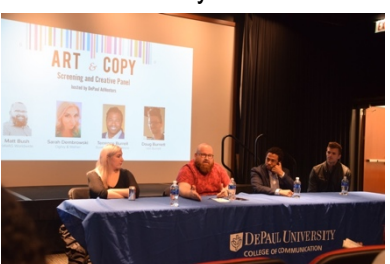
Art and Copy Screening and Creative Panel on March 31

DePaul University AdVentors and the One Club hosted a